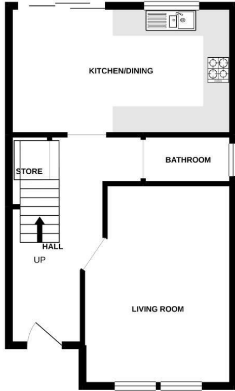
GROUND FLOOR 472 sq.ft. (43.9 sq.m.) approx.